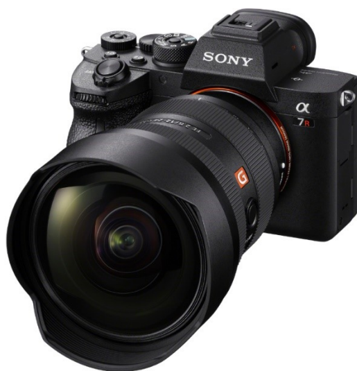
FE 12-24mm F2.8 GM lens with ILCE-7RM4 camera

The constant F2.8 maximum aperture at all focal lengths ensures that exposure is stable when zooming. In turn, this means that shutter speed and ISO sensitivity can remain consistent whilst shooting movies. The creative opportunities afforded by shooting movies at a 12mm angle of view with F2.8 constant aperture in full-frame are boundless, however, when used on an APS-C camera or with a Super 35 angle of view, the wide end of the zoom range becomes equivalent to 18mm, providing a very useful zoom range for moviemaking.